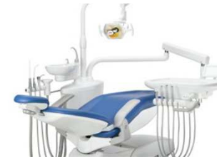
MEDICAL & DENTAL UNITS