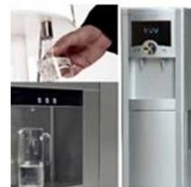
BEVERAGE & FILTERING