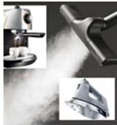
COFFEE & STEAM